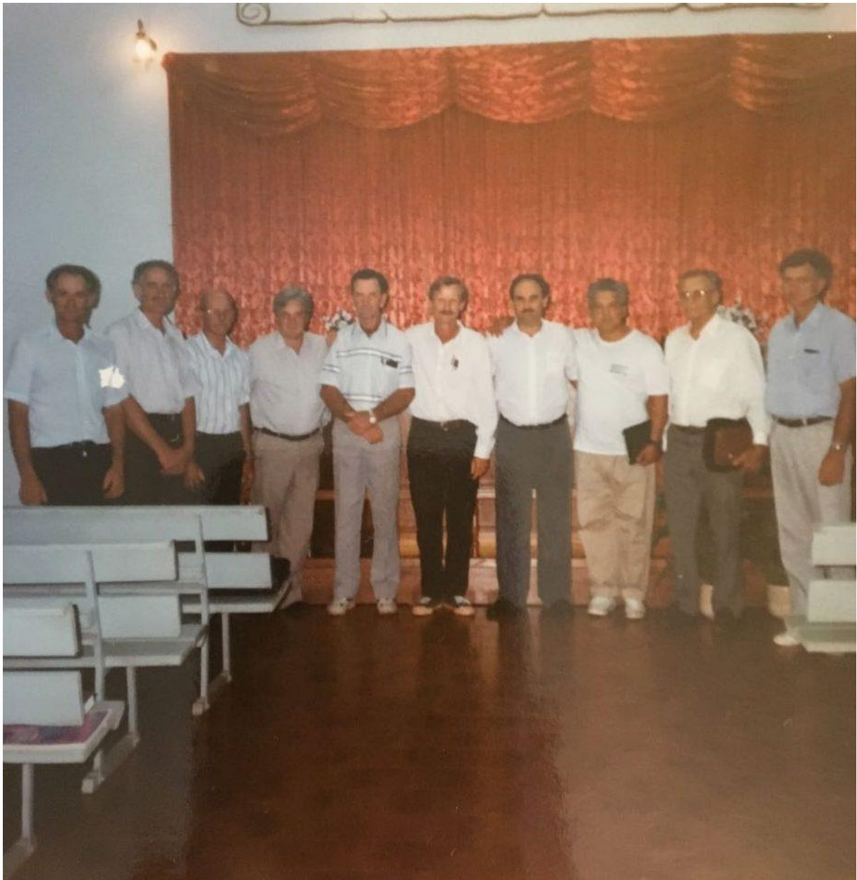
Servants in the church